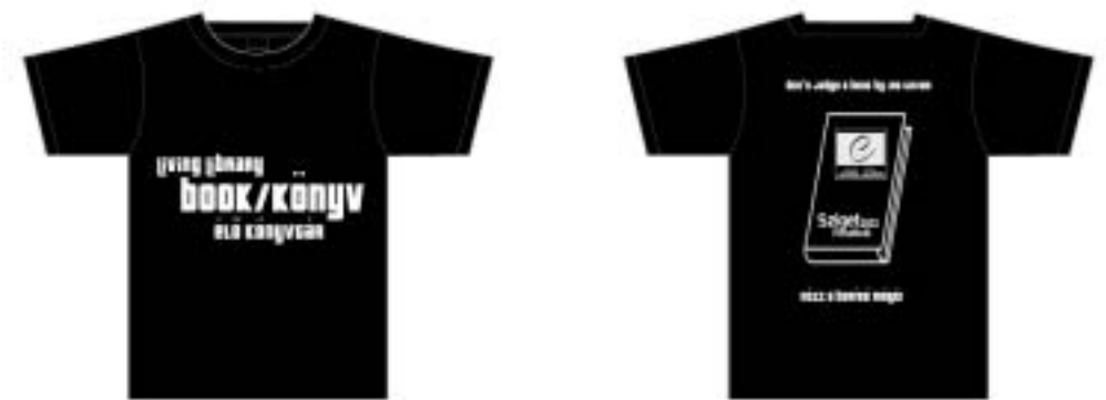
Book t-shirts of the Living Library at the SZIGET Festival Design: Art Factory, Budapest